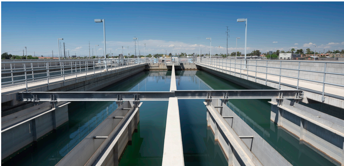
Oasis Water Treatment Plant

The following tables show regulated substances that were required to be tested and were detected in Glendale drinking water in 2019. The tables contain the name of each substance detected, the highest level allowed by regulation, the ideal goals for public health, the amount detected and the usual sources of such contamination. Certain contaminants are required to be monitored less than one time per year because concentrations of those contaminants are not expected to vary significantly from year to year. For those contaminants that were not required to be tested in 2019, this report includes data from the most recent required testing. The presence of contaminants does not indicate that the water poses a health threat, only that they were detected during routine compliance monitoring. Glendale monitors for many more substances that were not detected in 2019.