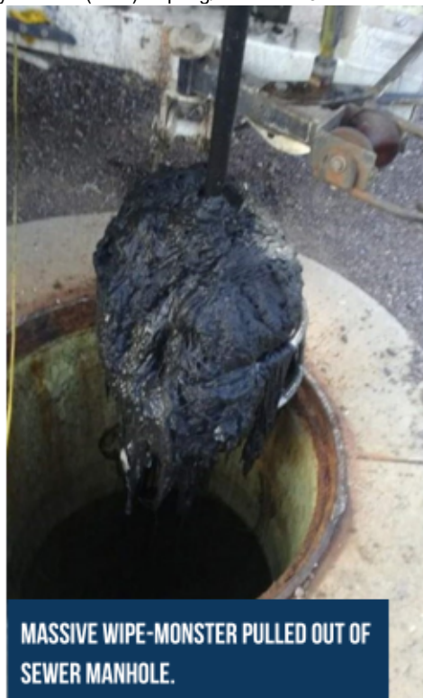
MASSIVE WIPE-MONSTER PULLED OUT OF SEWER MANHOLE.