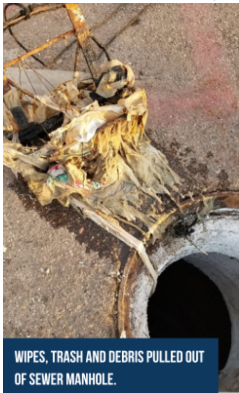
WIPES, TRASH AND DEBRIS PULLED OUT OF SEWER MANHOLE.