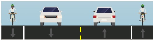
Current Travel Lanes (No Parking Allowed)