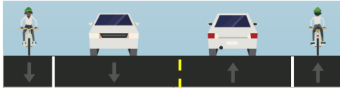
(No Parking Allowed)