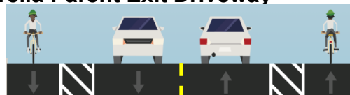
Proposed Travel Lanes