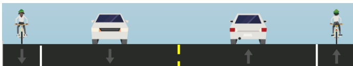
Current Travel Lanes (No Parking Allowed)