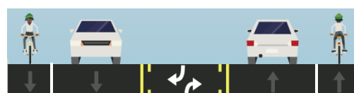
Proposed Travel Lanes