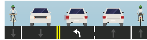
Proposed Travel Lanes