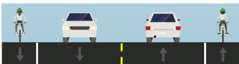
Current Travel Lanes (Parking allowed south side)