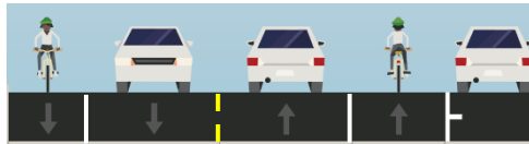
Proposed Travel Lanes