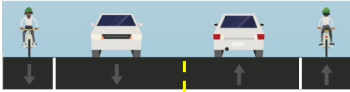
Current Travel Lanes (No Parking Allowed)