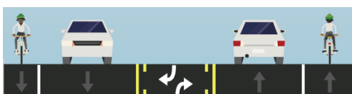
Current Travel Lanes (No Parking Allowed)