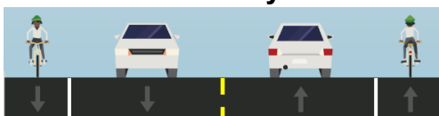
Current Travel Lanes (No Parking Allowed)