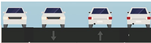
Current Travel Lanes