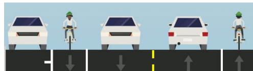
Future Travel Lanes