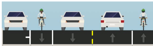
Future Travel Lanes