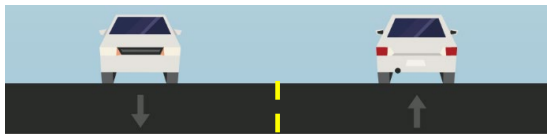
Current Travel Lanes

Bell Rd to Turtle Rock Basin Park Grovers Ave to Charleston Ave Villa Theresa Dr to Union Hills Dr