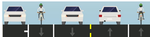
Proposed Travel Lanes