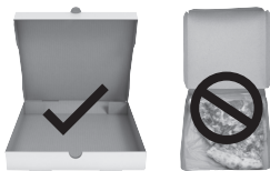
Recyclables must be free of food, grease and liquids