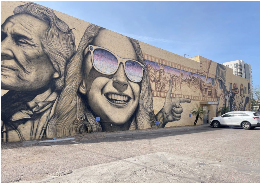
Photo 2. Northern façade, looking southwest, April 2025