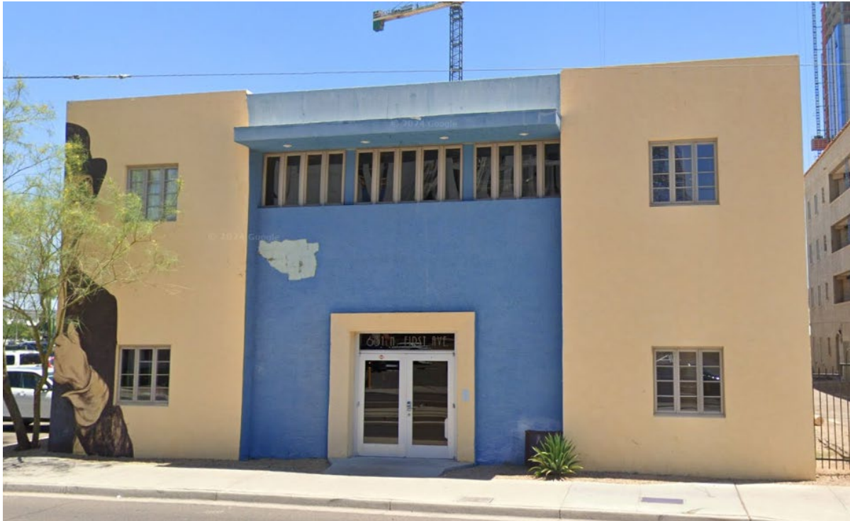
Photo 1. Front (western façade) of building, looking east from Central Avenue, Google Streetview June 2024