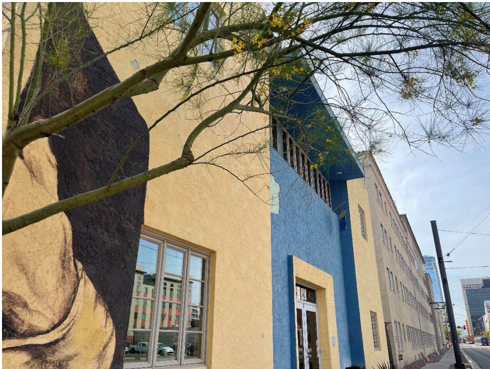
Photo 4. Front façade, looking southeast, April 2025