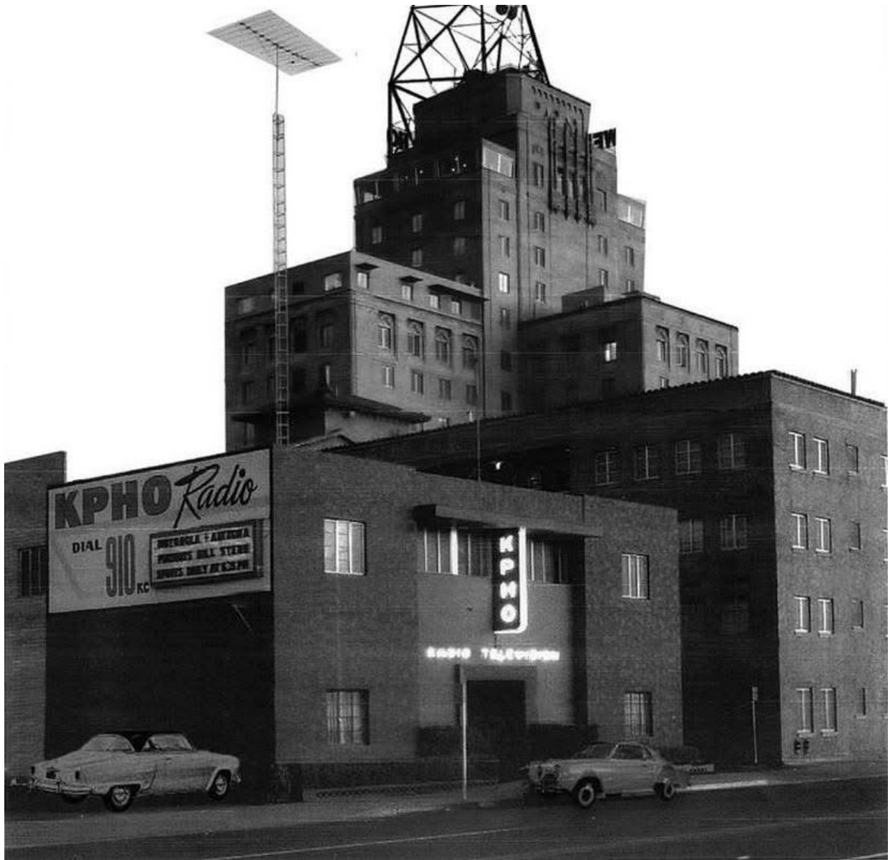
Photo 6. View of KPHO Building with Westward Ho and Tower in the rear ground. ca. 1950.