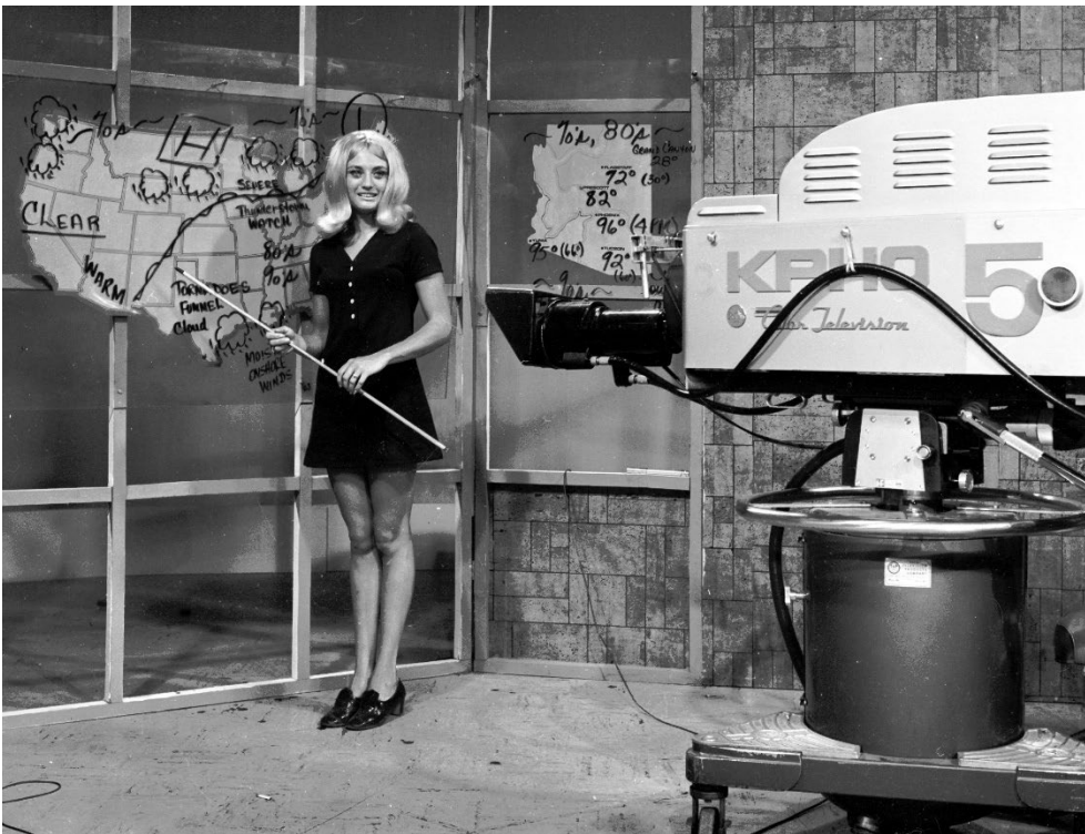
Photo 8. KPHO interior television studio room