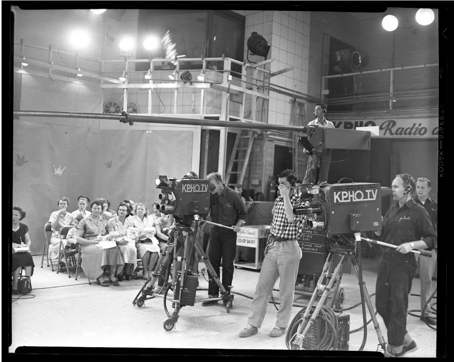
Photo 7. KPHO interior television studio room