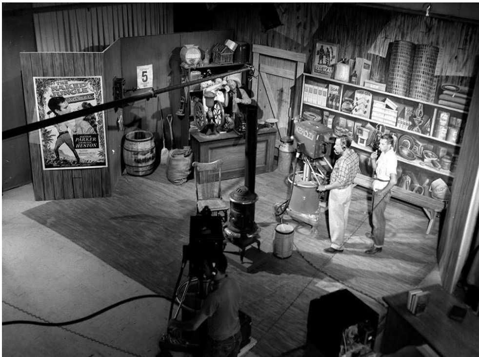
Photo 10. Gold Dust Charlie set at KPHO building, courtesy of First Studio