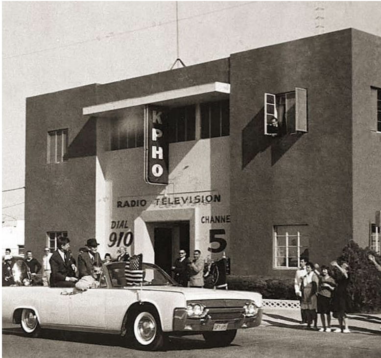
Photo 9. John F. Kennedy passing by building, 1961