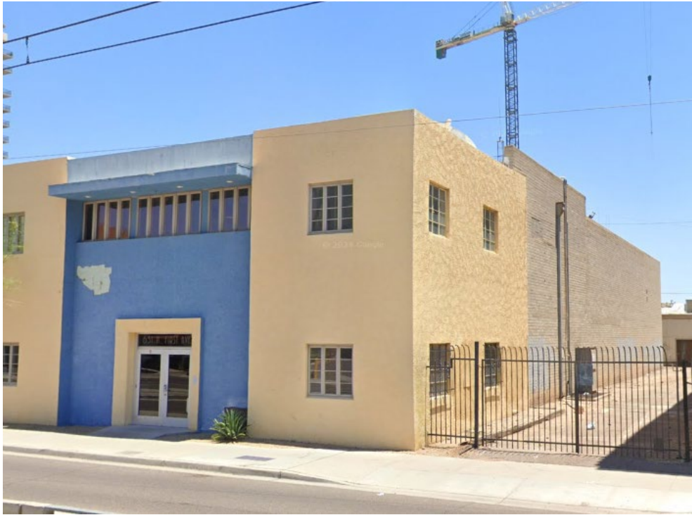
Photo 3. Western (front) and southern facades, looking northeast, Google Streetview June 2024