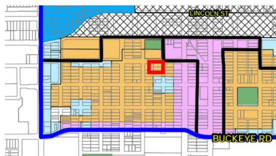
Downtown Plan proposed dwelling unit density map