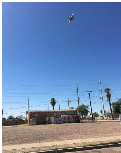
Incoming flight to the Phoenix Sky Harbor International Airport. View looking west from 2nd Avenue.

Stipulations 2, 3 and 4 address this request.