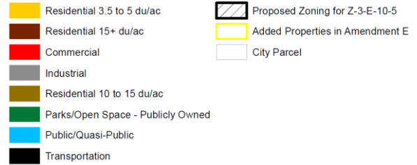
General Plan Land Use Map with proposed Major Amendment E land area annotated; Source: Planning and Development Department