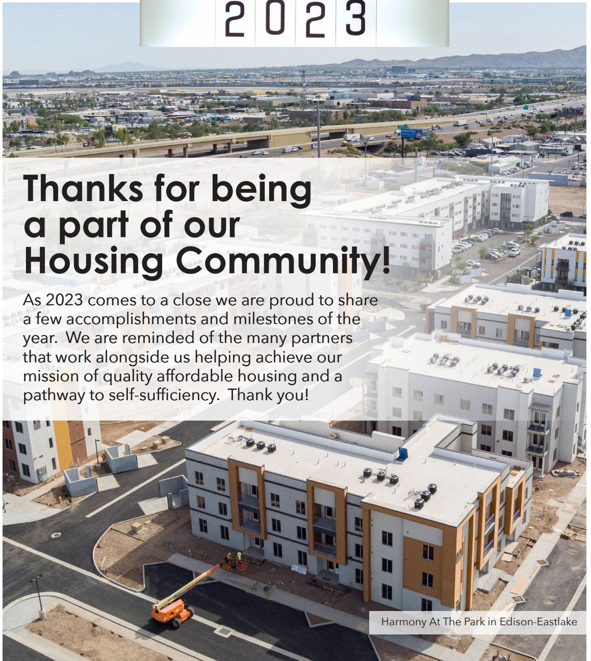
Harmony At The Park in Edison-Eastlake

As 2023 comes to a close we are proud to share a few accomplishments and milestones of the year. We are reminded of the many partners that work alongside us helping achieve our mission of quality affordable housing and a pathway to self-sufficiency. Thank you!