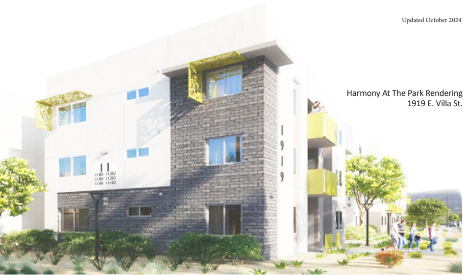
Harmony At The Park Rendering 1919 E. Villa St.