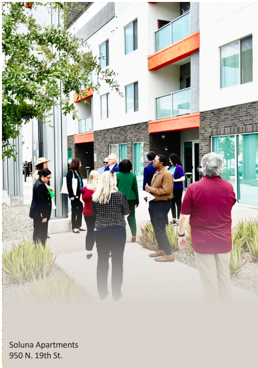
Soluna Apartments 950 N. 19th St.