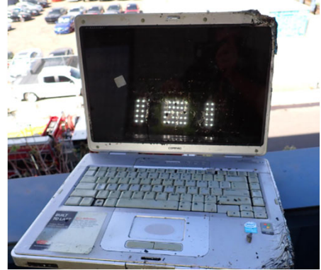
Laptop stored outside in a plastic tote.