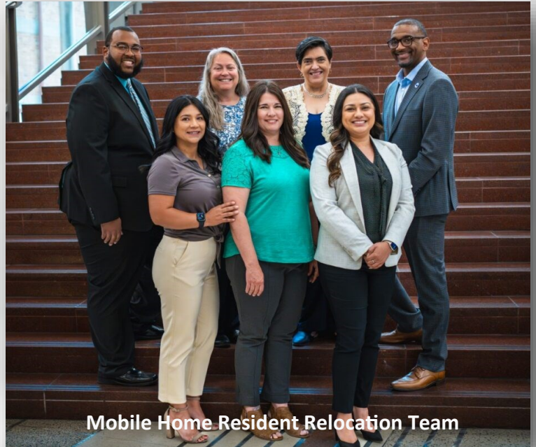
Mobile Home Resident Relocation Team