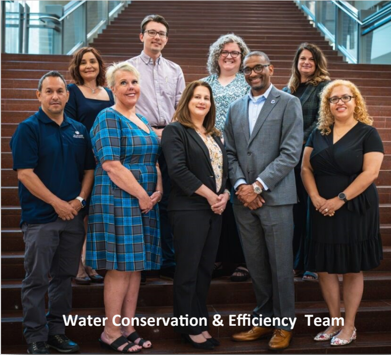
Water Conservation & Efficiency Team

THE FOLLOWING RECIPIENTS SUCCESSFULLY IMPLEMENTED AN INNOVATIVE IDEA, WHERE OUTSTANDING RESULTS WERE ACHIEVED OR AN EFFICIENCY THAT RESULTED IN LOWER COSTS OR SAVINGS TO THE ORGANIZATION