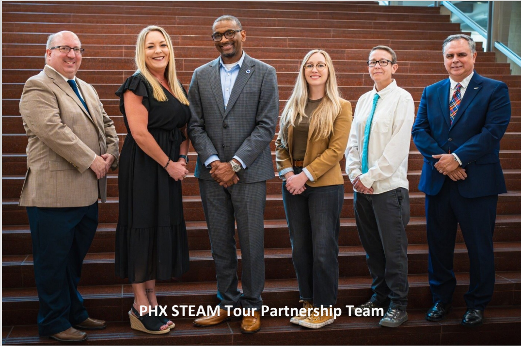
PHX STEAM Tour Partnership Team

THE FOLLOWING RECIPIENTS SUCCESSFULLY IMPLEMENTED AN INNOVATIVE IDEA, WHERE OUTSTANDING RESULTS WERE ACHIEVED OR AN EFFICIENCY THAT RESULTED IN LOWER COSTS OR SAVINGS TO THE ORGANIZATION