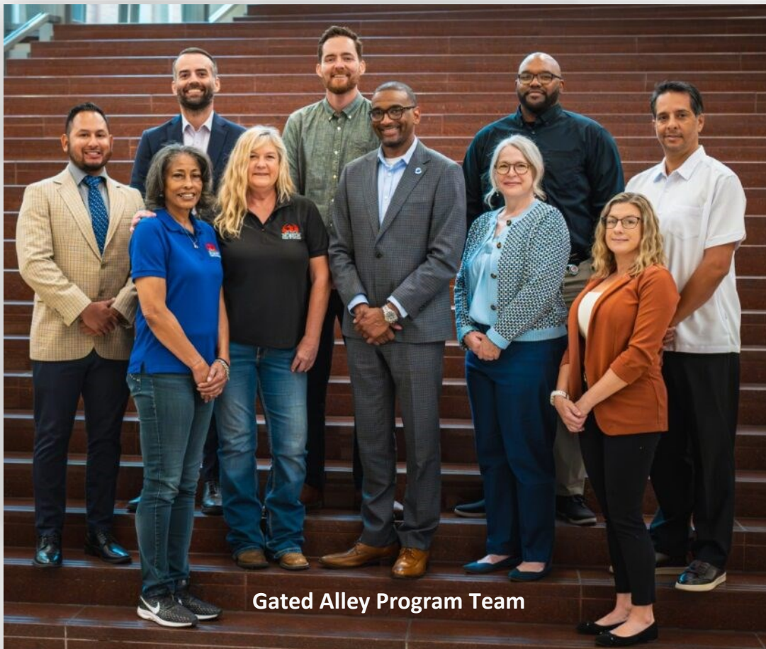
Gated Alley Program Team