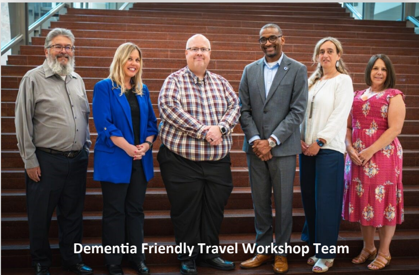
Dementia Friendly Travel Workshop Team