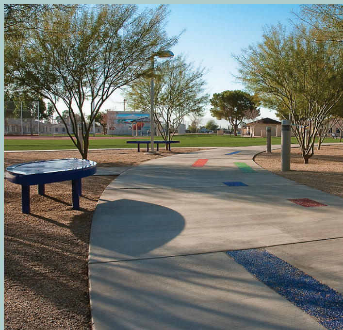
STACY LEVY, 2010 COUNCIL DISTRICT 8

This artwork, located at Harmon Park, was created in 2010 and required several repairs. Artist Stacy Levy designed paths embedded with colorful glass, invoking the flow of water, that are integrated into the design of the park. The project repaired cracked and uneven pavement and replaced worn areas of the embedded glass.