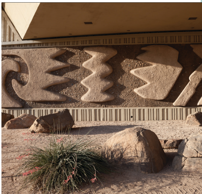
MARILYN ZWAK, 1990 COUNCIL DISTRICT 4

Specialists experienced with the building material adobe completed extensive renovations of Our Shared Environment by Marylin Zwak. Several issues were addressed, including water damage, cracking, and soot from vehicle exhaust. The wall treatments are located at the intersection of SR51 and Thomas Road. The 3-year project was completed in April 2025.