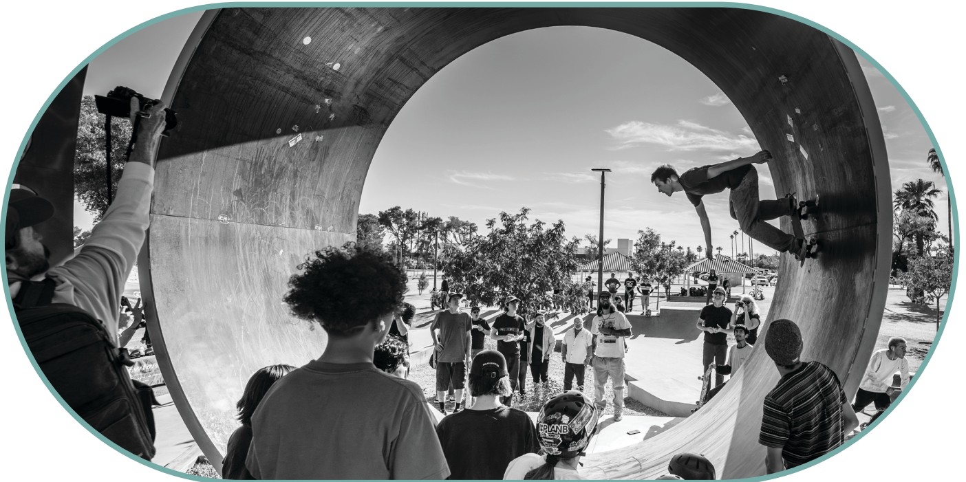
Pipe Dreams by Haddad Drugan, 2024. Located at Solano Park in District 4.

The Phoenix Office of Arts and Culture develops the Public Art Plan annually with input and assistance from the Mayor and City Council, residents, artists, city departments that provide public art project funding, and the Arts and Culture Commission. The timing of the plan coincides with the annual Capital Improvement Program, budgeted per fiscal year (for example, FY 2025-2026 = July 1, 2025 – June 30, 2026). The plan outlines several project types, including design team projects, permanent commissions, purchases of existing artwork, temporary commissions, art refurbishment and retrofits, and master planning.