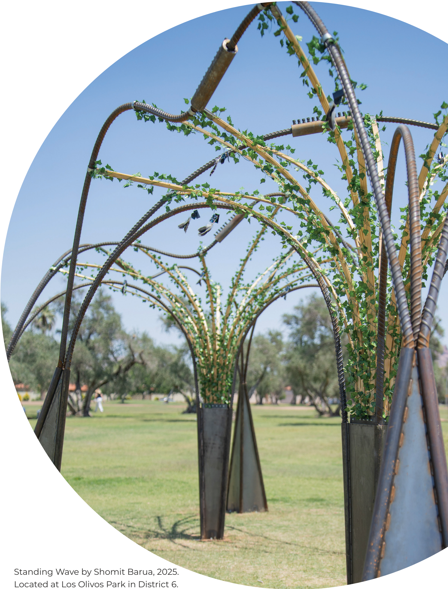
Standing Wave by Shomit Barua, 2025. Located at Los Olivos Park in District 6. ¡Sombra! Experiments in Shade temporary installation.